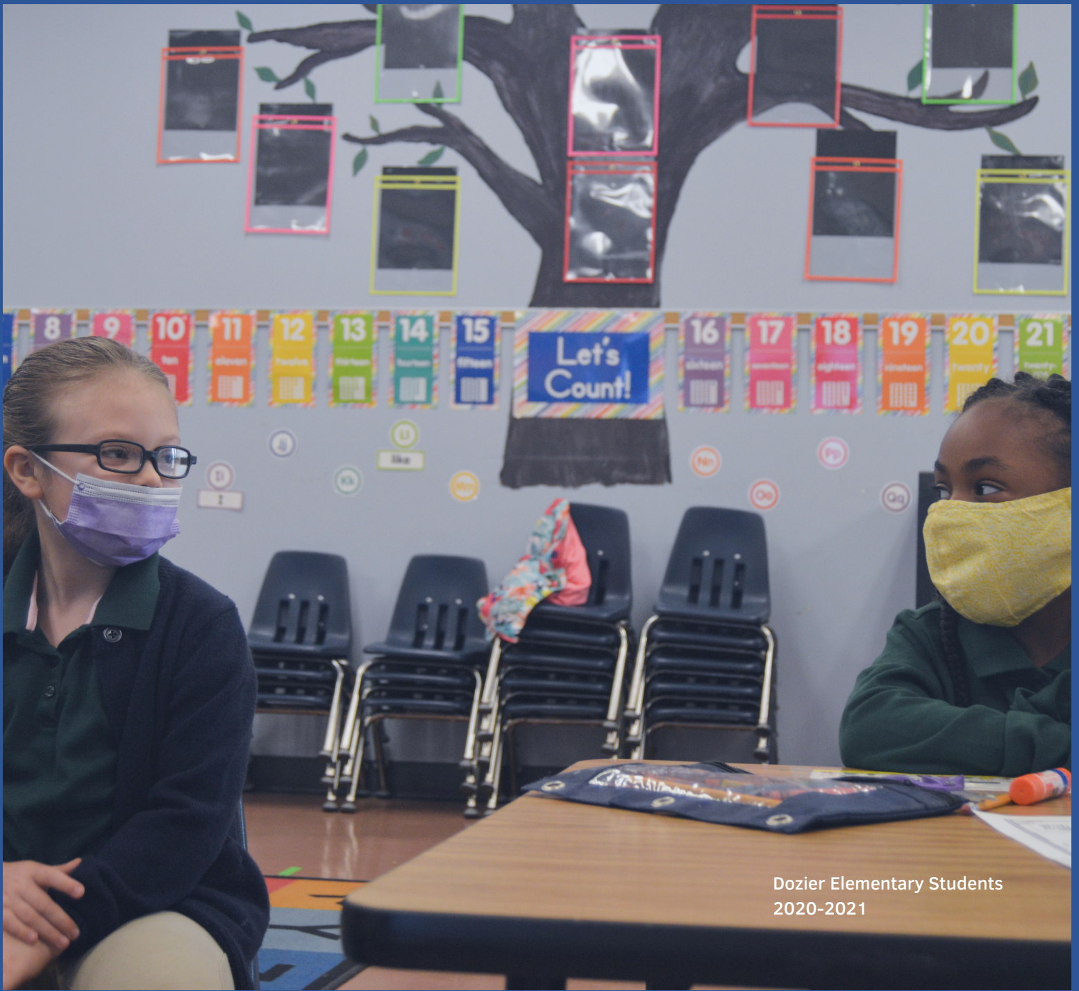
Dozier Elementary Students 2020-2021